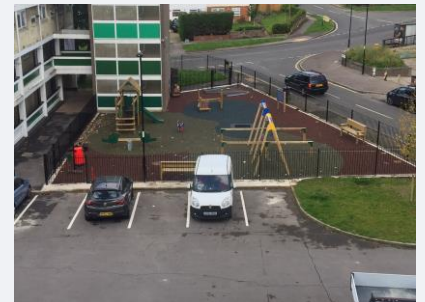
New Playground at Vanguard Road