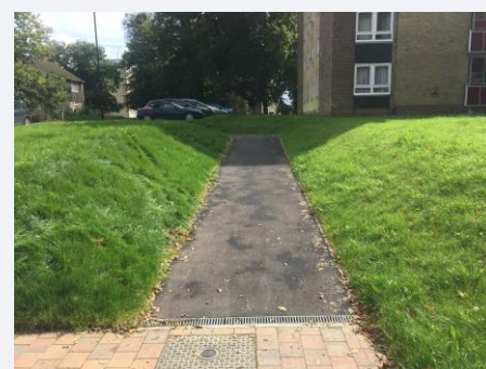
New Access Ramp to Flats

Since the completion of the works the residents of Townhill park have put PTC forward for a TPAS award for our community engagement on this project.