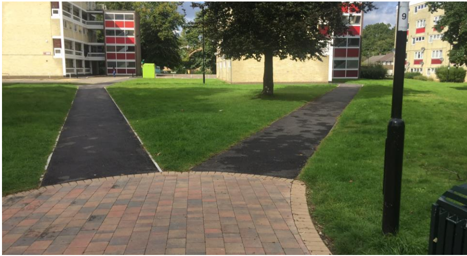
Pathways at Macarthur Crescent